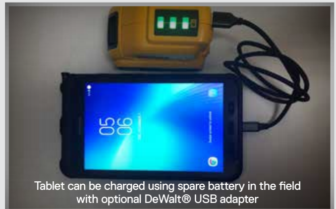
Tablet can be charged using spare battery in the field with optional DeWalt® USB adapter