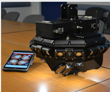
> Tablet Controlled