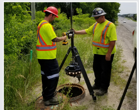
> Wireless Connection