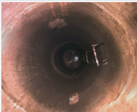
> Live Video

SPiDER provides a 190 degree field-of-view live video stream making it an ideal tool for I&I studies.