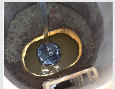
> Virtual Tether