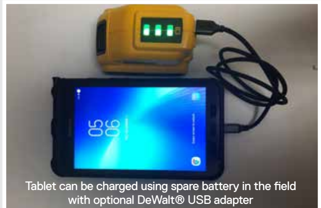
Tablet can be charged using spare battery in the field with optional DeWalt® USB adapter