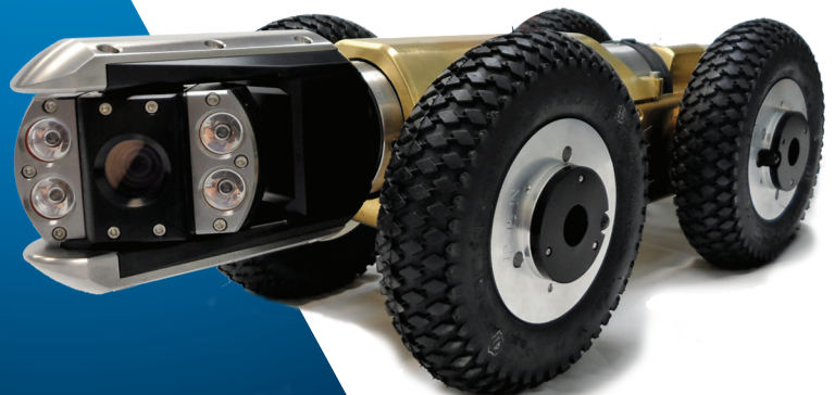
12" (305 mm) Pneumatic