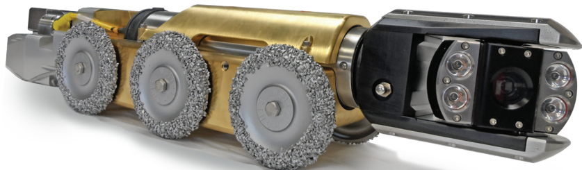
8" Steel (203 mm)