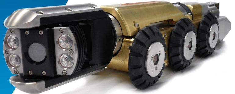
8" Rubber (203 mm)