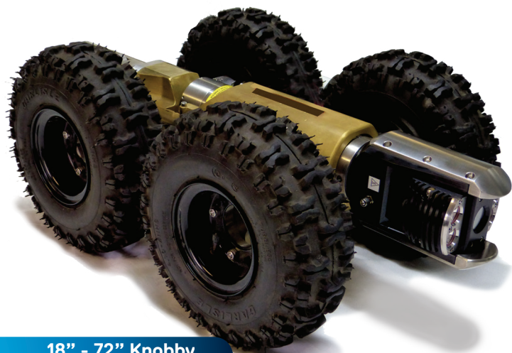
18" - 72" Knobby (457-1829 mm)