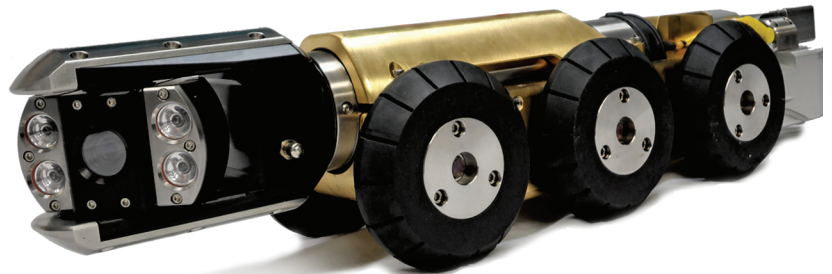
10"- 15" Rubber (254-381 mm)